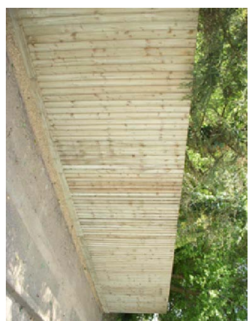
TELECOMMUNICATION SYSTEM TO BE FENCED IN. TOWER CLOSE BOARDED