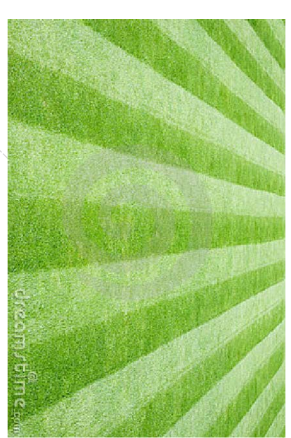
EXISTING STRIPES TO BE REMOVED. NEW LAWN TO BE LAYD.