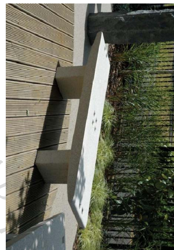
CHANNIKI STANDARD BENCH, CONCRETE BENCH WITH PERFORATED POLISHED GRANITE EFFECT AND SANDRAGED LEGS. THE SITE PLAN AND DESIGN REFLECTS THE FORM OF AN AIRPLANE WING.