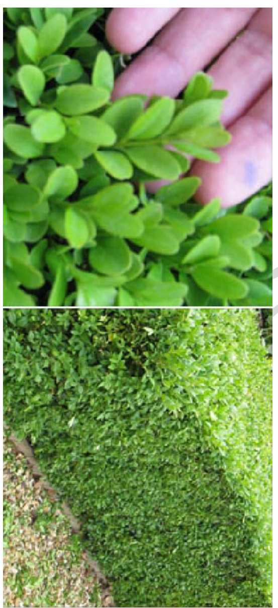
BOLUS SEWERPENS (COMMON BOB) HEDGE, TWO POT PLANTS 200MM APART. SPREAD ORNAMENTAL BARK AROUND THE BULBS.